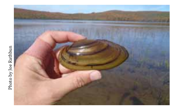
The Giant floater, Pyganodon grandis, is found in Gratiot Lake.

This workshop will cover the identification of mussels (also known as clams) found in inland lakes and rivers in the Keweenaw Peninsula and nearby counties. There will be a slide talk and short mussel identification practice session at the conservancy's Noblet Field Station in the morning followed by a hands-on mini-survey at Gratiot Lake after lunch. Topics that will be discussed are the importance of mussels to the ecology of lakes and streams, tips on identifying mussels, and the usefulness of mussel surveys in helping to determine the health of aquatic systems. Participants will receive a key to identifying mussels found in the Upper Peninsula. The afternoon survey will provide data on Gratiot Lake clams which will be submitted to the Michigan Natural Features Inventory.