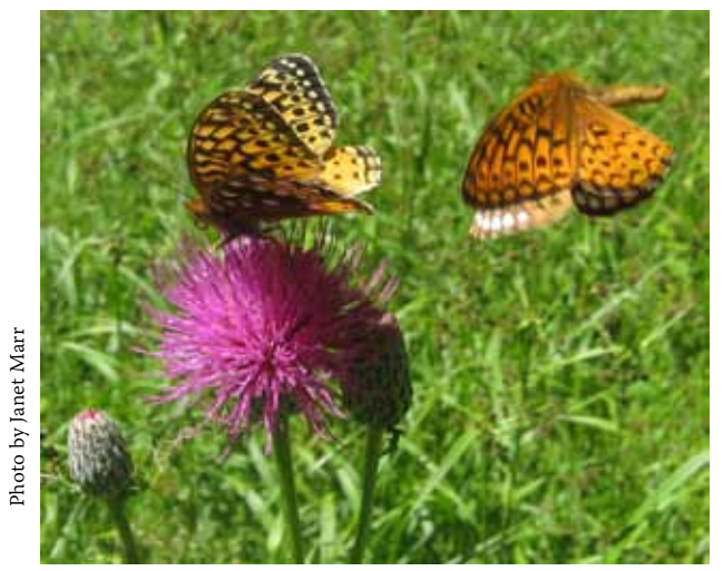
Native Swamp thistle at Bammert Farm with Atlantis fritillary butterflies. There were three species of fritillary butterfly observed by Jim Bess at Bammert Farm last July: Great spangled fritillary, Silver-bordered fritillary, and Atlantis fritillary.

Invasive European marsh thistle, Cirsium palustre (pictured above) should also be removed. This thistle is not to be confused with a desirable native relative, Swamp thistle, Cirsium muticum (pictured below ) that is also present! "Muticum" means "blunt." Swamp thistle has smooth stems without wings and softly spiny leaves. It does not have hard spines on the flower head.